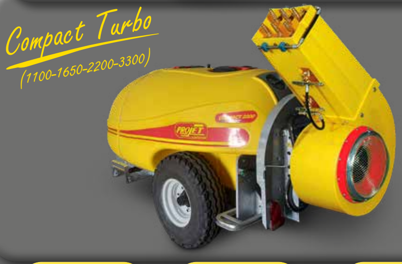
Compact Turbo (1100-1650-2200-3300)