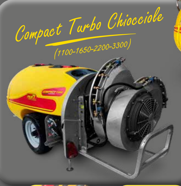
Compact Turbo Chiocciola (1100-1650-2200-3300)

Aufgeführte Daten und Merkmale auf diesen Prospekt gelten als Richtlinie. Los datos y las descripciones del presente folleto tienen solamente valor indicativo y pueden ser cambiados sin previo aviso. Технические характеристики и описания в брошюре носят ознакомительный характер.