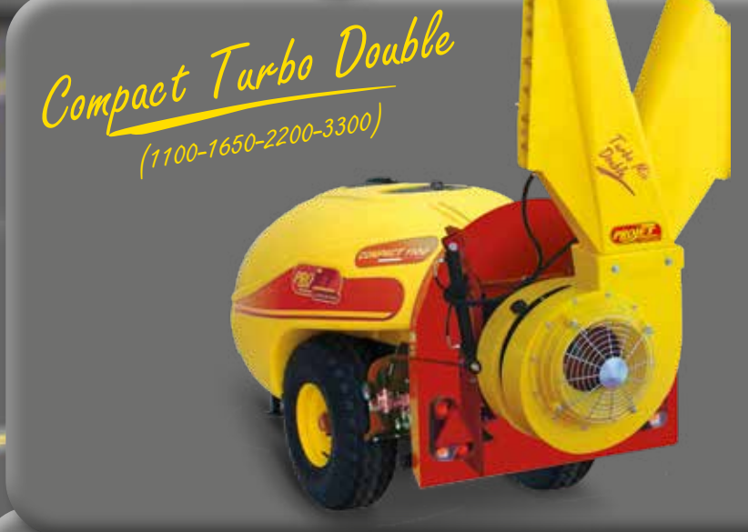
Compact Turbo Double (1100-1650-2200-3300)