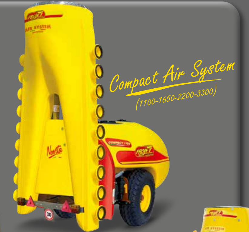
Compact Air System (1100-1650-2200-3300)