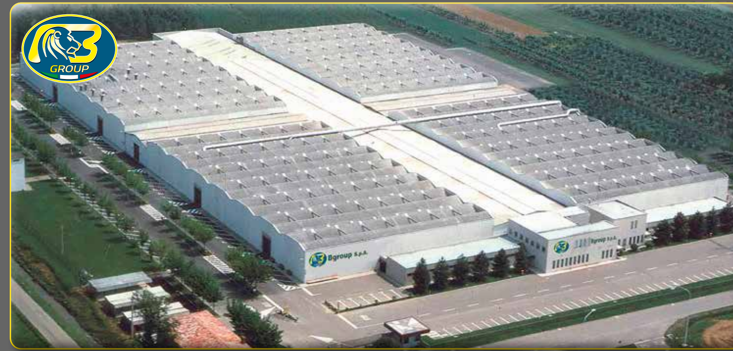
Imola (Bologna) - Sede principale