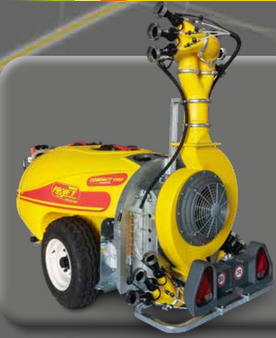
Compact Pneu (600-880-1100-1650-2200)