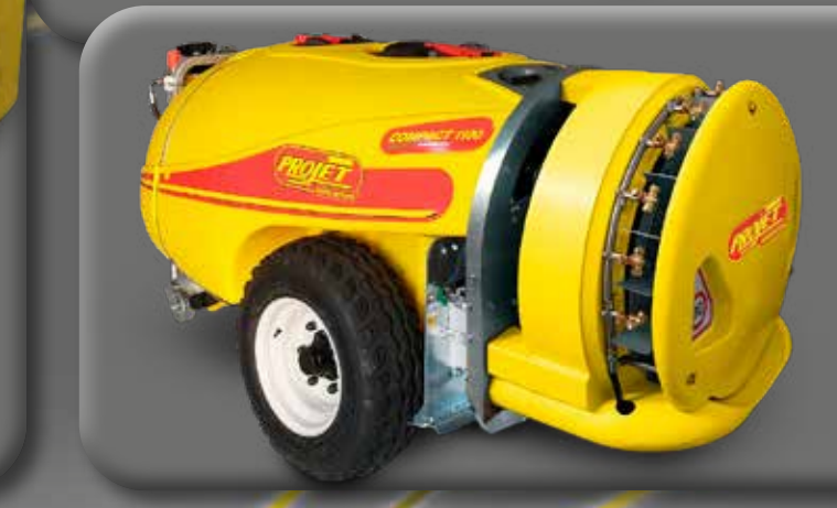
Compact Vigne (660-880-1100)