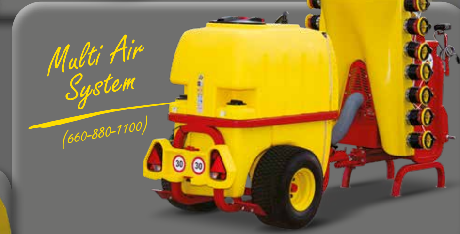
Multi Air System (660-880-1100)