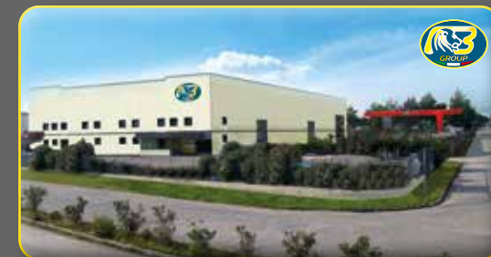
Jesi (Ancona) - Stabilimento produttivo