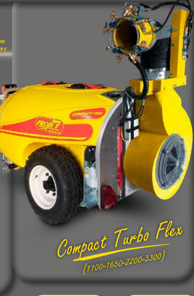
Compact Turbo Flex (1100-1650-2200-3300)