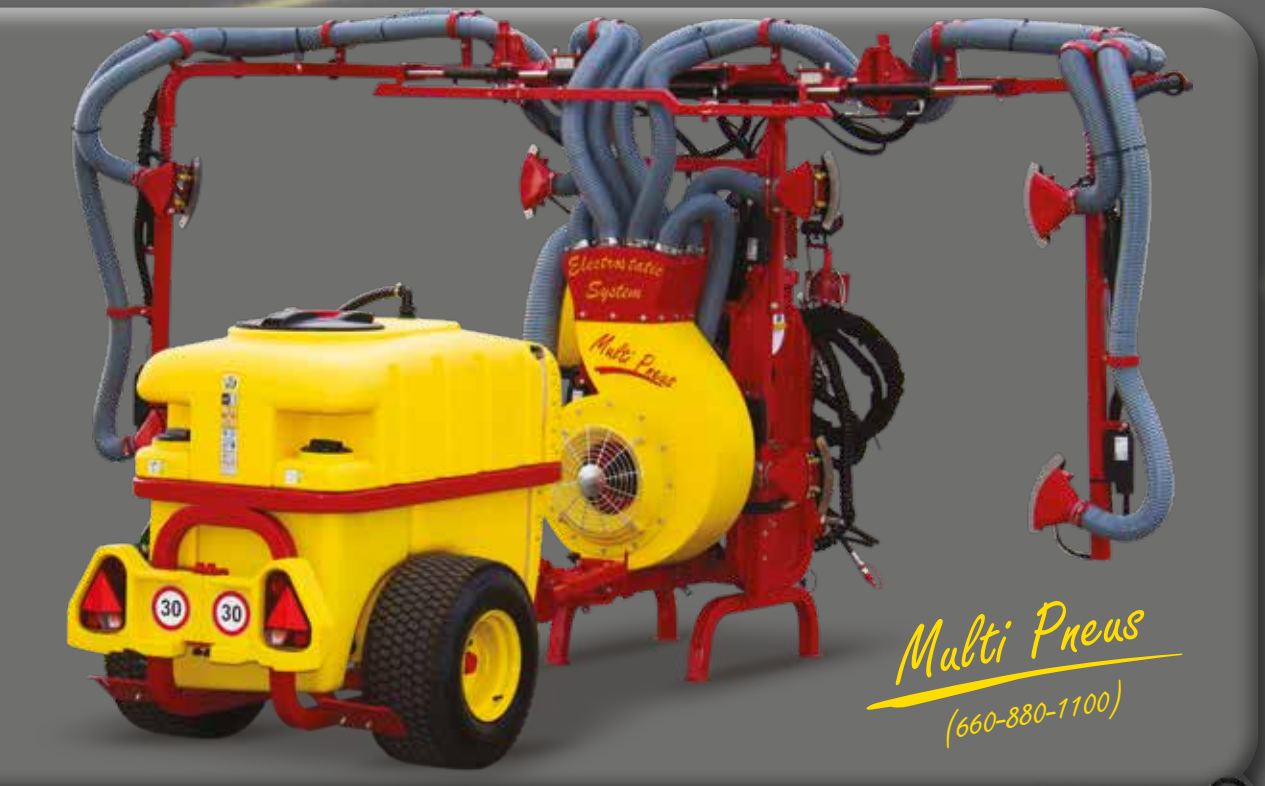
Multi Pneu (660-880-1100)

I dati e le descrizioni del presente opuscolo hanno soltanto valore indicativo. The specifications and descriptions in the present brochure are purely indicative. Les données et les caractéristiques de cette brochure ne sont fournies qu'à titre indicatif.