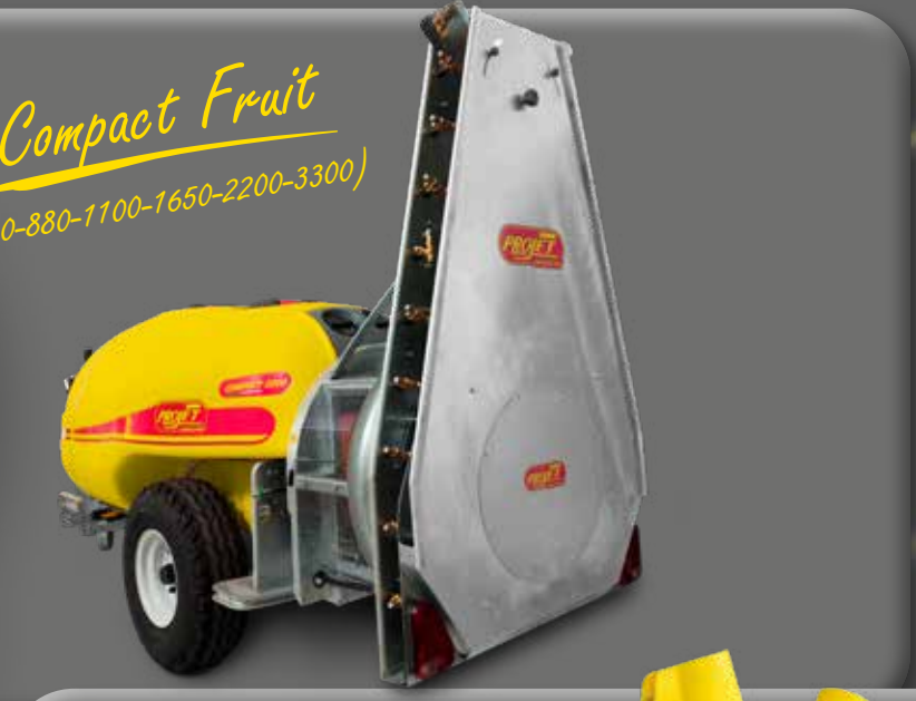
Compact Fruit (660-880-1100-1650-2200-3300)